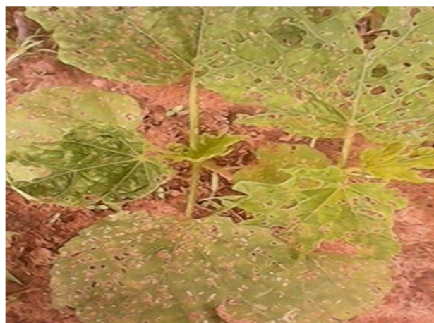
Plate 3: Feeding character of flea beetle (shot holing)

encountered in the study include: Syagrus calcaratus Fahr, Nisotra dilecta Dalm (Coleoptera: Chrysomelidae), Alcidodes sybvillosus Fahr (Coleoptera:Curculionidae), Silidius apicalis Waterh (Coleoptera:Cantharidae) and Etigmere edlingeri Bartei (Heterocera:Arctiidae).