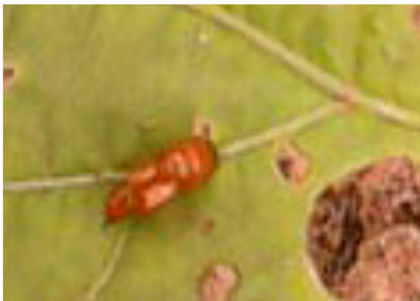
Plate 1: Monolepta goldingi