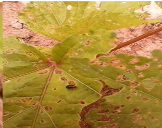
Plate 2: Monolepta nigeriae

The peak population of 20.17 M. goldingi and 3.17 M. nigeriae occurred at the vegetative stage creating "shot holing" on the leaves of the plant (Plate 3). The population of the two decreases drastically at the fruiting stage of the crop (i.e. after 9 WAP). Other insects