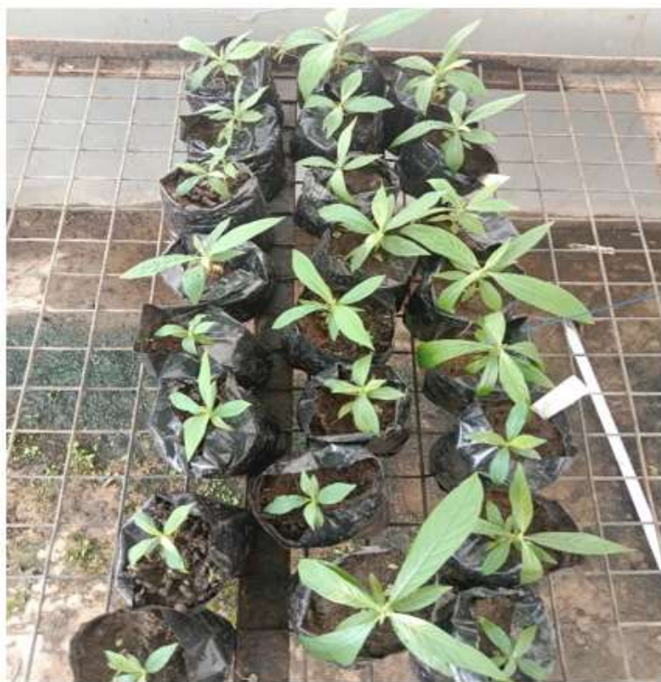
Pla 2a: Hardening of fully grown in-vitro propagated plantlets of M. lucida , under acclimatization chamber.