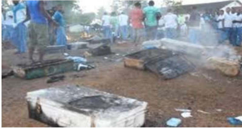
Figure 1: Students burn a school in Kenya

The immoral behavior is invariably as a result of lack of values which are principles, convictions or standards that influence a person's or community's conduct or actions in any situation. Values are the inner drive that explain why people behave or do what they do. They determine what a person considers important in life. When combined with knowledge, correct attitudes and life skills, values are what sustain a person's conduct. Thus, according to Indrani (2012), value shapes our relationships, our behaviors, our actions, and our sense of who we are. According to Kumar (2015), the value-based education is being taught in schools in