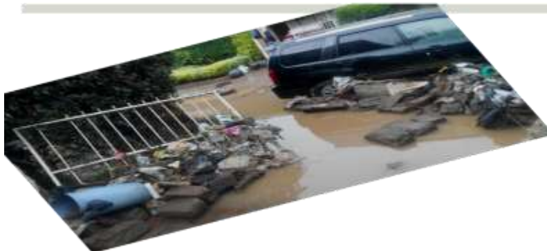
Figure 2: Behaviours of people deficient in basic core values.

India or included in all types of education because it plays a great role towards learners' personality and helps to become successful in their lifespans and careers as well. The absence of values makes people irresponsible as illustrated in Figure 2. The scenario carried in Figure 2 sends an alarming cumulative effect of our current education system that lacks core-values. In fact, we would benefit in terms of overall progress (good health, security and happiness) if our houses were mud-huts in communities that value our common good through providing good sanitation, food, education, drinking water, and basic health care.